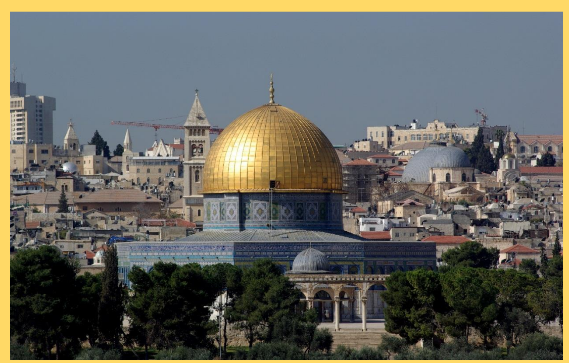
How Charitable Organizations and Taxpayers Finance the Flames of Confrontation in Israel