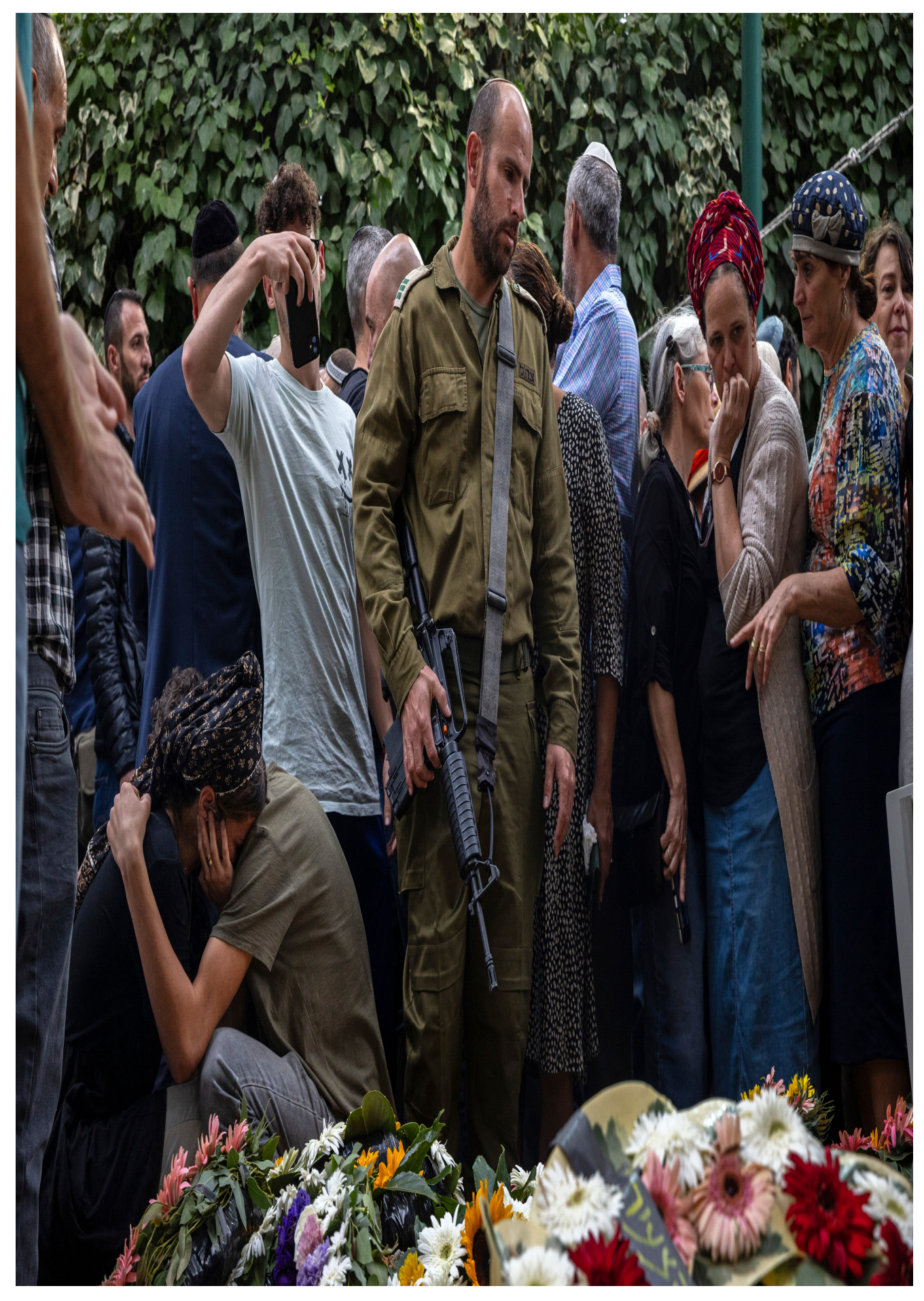
Enlarge this image.